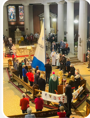
Pics show the launch of the Synod in Armagh, Dublin and Clonfert