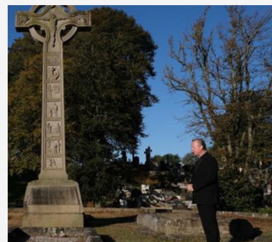
Archbishop Eamon Martin at the graves of his predecessors in Armagh

Archbishop Eamon Martin and the other Church leaders in Ireland invite all people of goodwill to join them in prayer during the Service of Reflection and Hope which will be broadcast live from St Patrick's Church of Ireland Cathedral, Armagh on RTÉ and BBC television networks on Thursday, 21 October 2021 at 11am. The Church leaders see this service as a moment in a much longer journey towards reconciliation which will require the prayerful support and engagement of Christians across these islands.